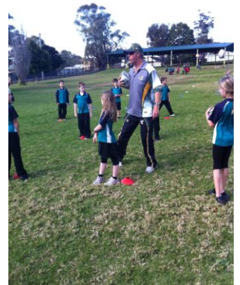
Knights Rugby League Clinic