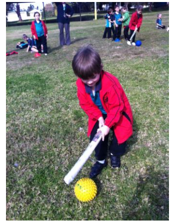
Knights Rugby League Clinic